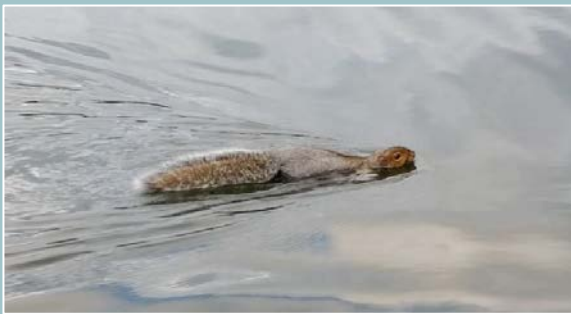
a few years ago.