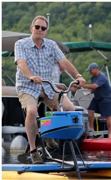
They came by boats, canoes, kayaks, pontoon boats, rafts, water bikes, and paddle boards, TO CELEBRATE TOGETHER OUR SPECIAL LAKE COMMUNITY.

THIS EVENT WAS REALLY SPECIAL. It showed the true spirit and fun of being the luckiest PLAKERS on earth who have an extended family at Partridge Lake.