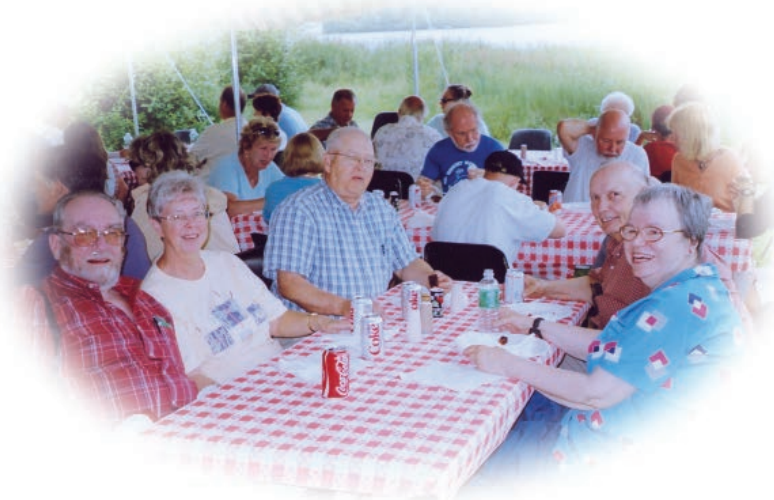
How about a senior citizen discount! The PLPOA annual picnic is enjoyed by so many, both young and old.