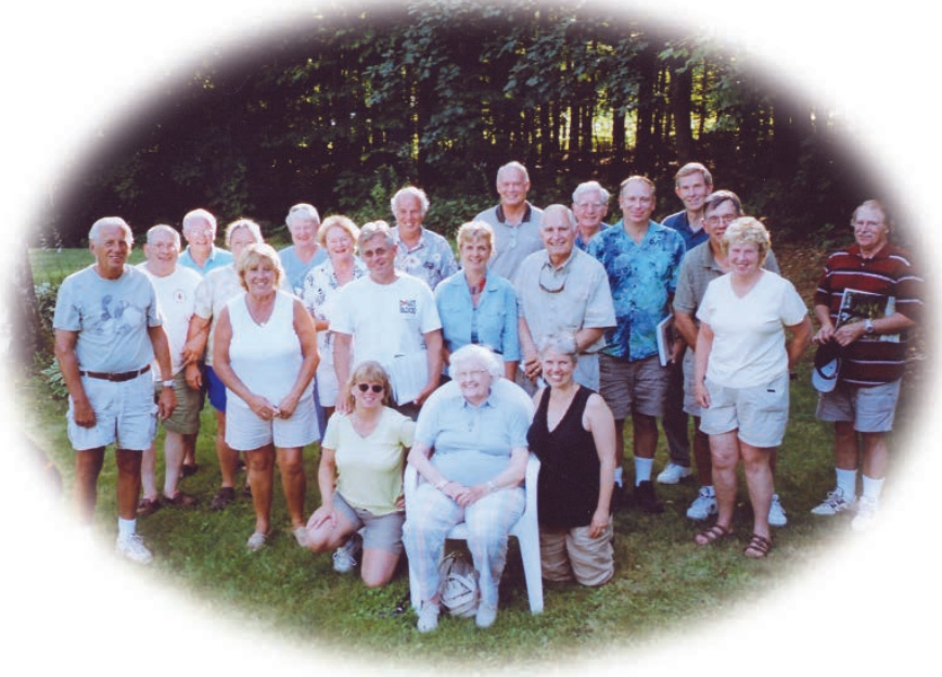
▲ A cheerful gathering of lake residents at the Nelson camp for the Annual PLPOA meeting held on Sunday, July 29, 2007.