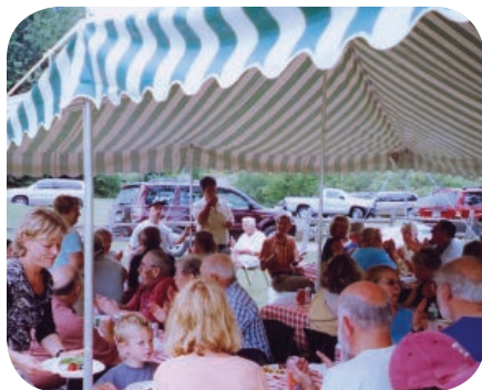
Partridge Lake Annual Picnic 2007.